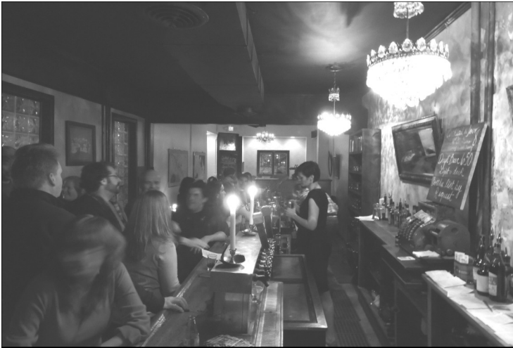
Patrons pack the old-fashioned bar of WC Harlan on opening night, January 21st, 2013.