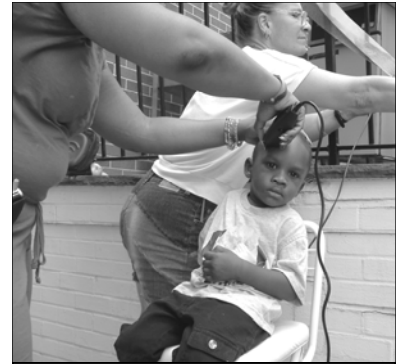
From Back to School Fair in 2006.