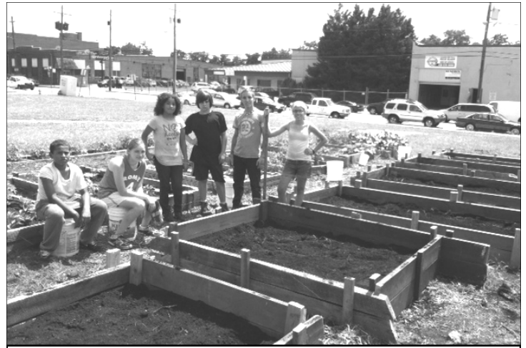
Epiphany Church teens working on the garden lot on 27th and Sisson St. This lot has been empty for many years and now hosts a community garden.

Epiphany Episcopal Church has had members come down to visit Remington in this program for several years now. A couple years ago they painted the mural on the wall at 26th and Miles; where now there are newly built garden beds for the community. They all enjoyed their time and many of them will come back throughout the year to do more service work in the neighborhood.