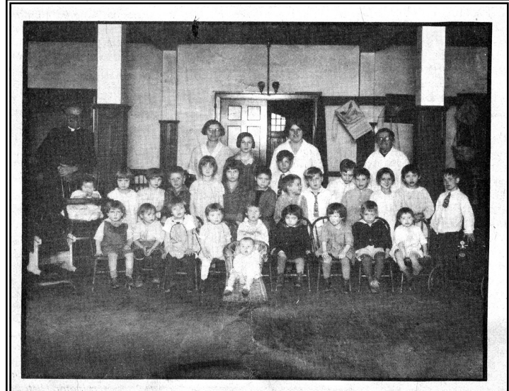
1933 Mothers who worked at the mill and at the American Can Company sent their children to the day care center at the Church of the Guardian Angel, believed to be one of the first day care centers.