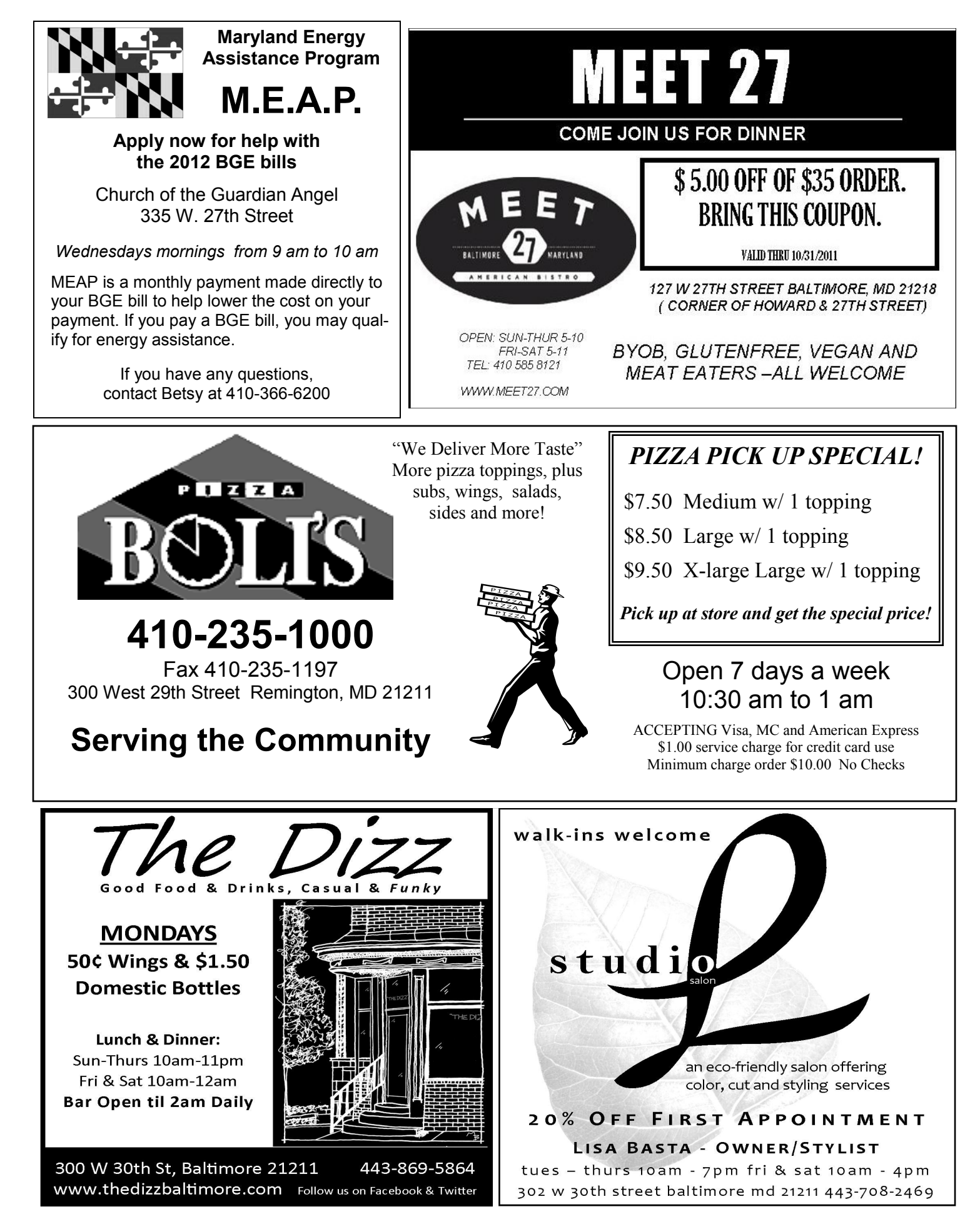
Remington Community Newsletter