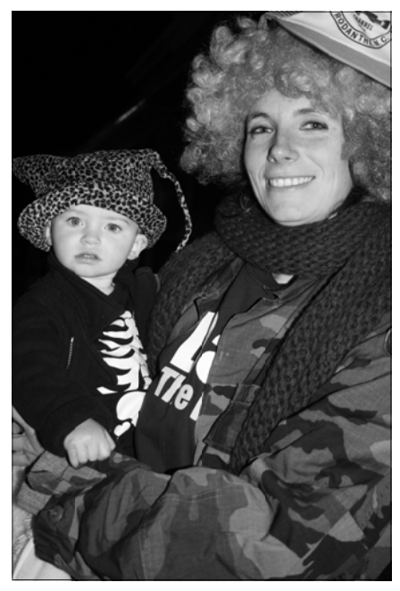
HAUNTINGDON 2010 for Remington Fun!