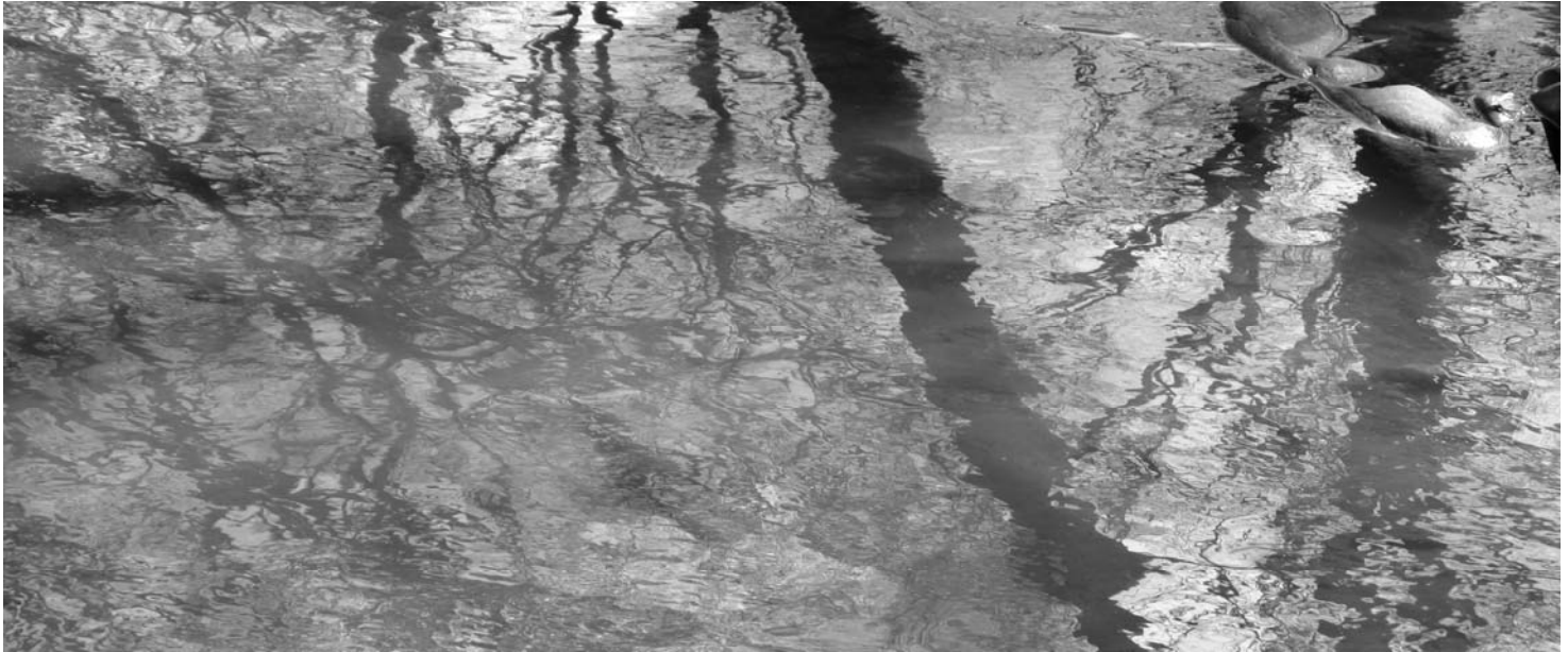
Reflections in Stony Run